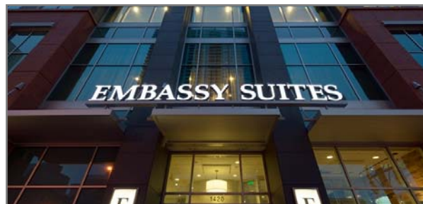
Conference held at Embassy Suites by Hilton Denver Downtown Convention Center Denver, Colorado