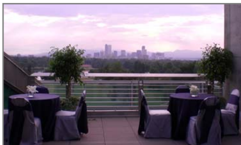
June 26 Reception held at Denver Museum of Nature & Science Bus transportation provided

Conference materials will be available for download from the CHAM.us website after the conference.